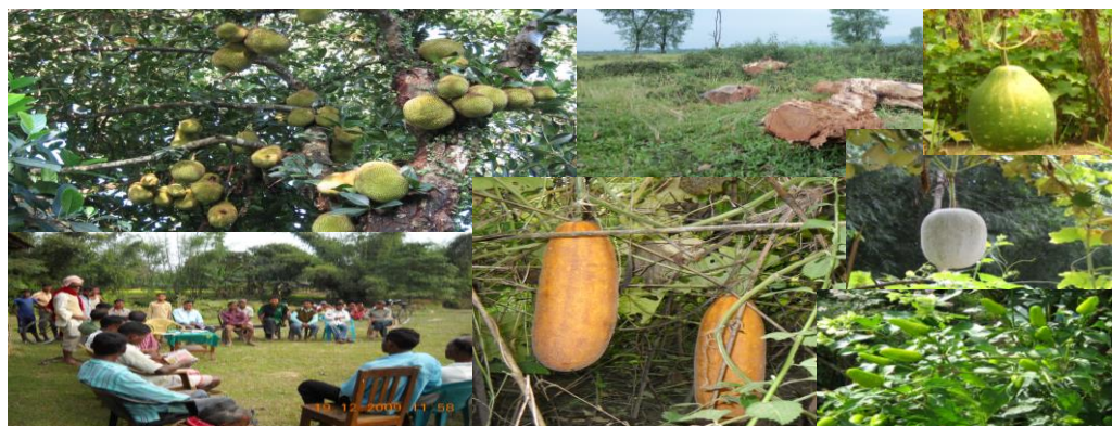
Kitchen Gardening by the Community